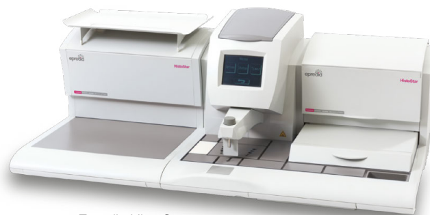
Epredia HistoStar Embedding Workstation