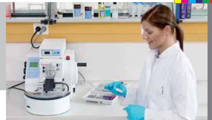
Freedom of choice of optional accessories – from the largest clamp to STS and Cool-Cut