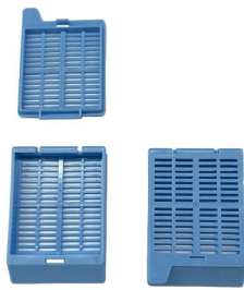
Pore: Slotted Open: Front open

Dakewe's HistoFlo™ cassettes are engineered to optimize print quality when used with laser cassette printers from Dakewe. The cassettes allow efficient processing and specimen safety. HistoFlo™ cassettes are made of P.O.M materials and resistant to common processing chemicals and heat.