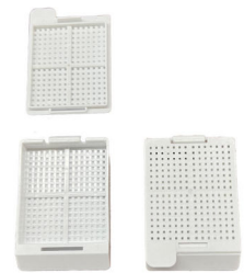
Pore: Square Open: Front open

002119□□ 002109□□ 90 pcs/tube 75 pcs/tube loose packed attached lids lids