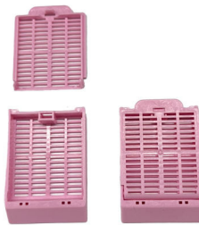
Pore: Slotted Open: Back open

002019□□ 002009□□ 90 pcs/tube 75 pcs/tube loose packed attached lids lids