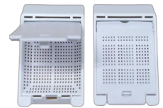
Pore: Mesh Open: Back open