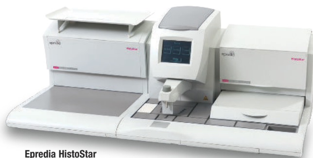
Epredia HistoStar Embedding Workstation